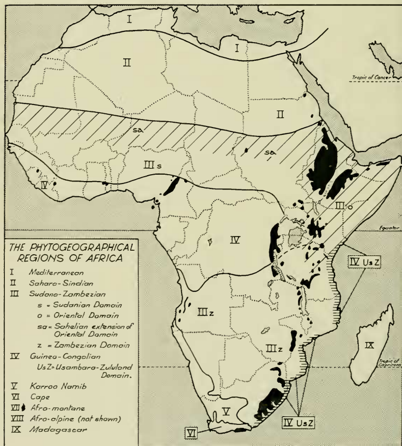
Fig. 5. Map of Africa showing phytogeographical Regions.

In my opinion the major phytochoria of Africa — the 9 chorological Regions, based on the work of LEBRUN (1947), MONOD (1957) and WHITE